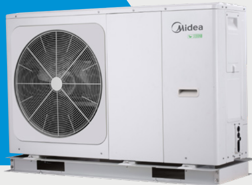
MHC-V8 - MHC-V16