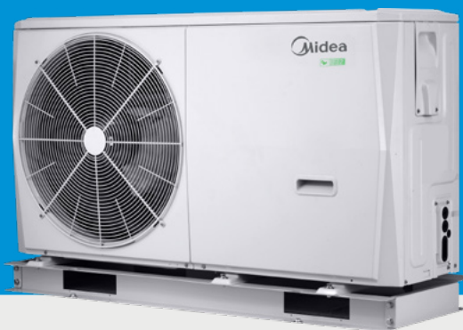
MHC-V4 & MHC-V6

*Sound pressure level is measured at a position 1m in front of the unit and (1+H)/2m (where H is the height of the unit) above the floor in a semi-anechoic chamber. During in-situ operation, sound pressure levels may be higher as a result of ambient noise.